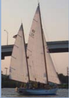
Heritage in Apalachicola

The museum was founded to celebrate and preserve the maritime history of Apalachicola in an hands-on learning environment with active sailing, boat building, restoration and educational displays. Collectively, the activities of the AMM will provide a glimpse into the rich and diverse history of the three rivers that come together to form the largest river in Florida, the Apalachicola.