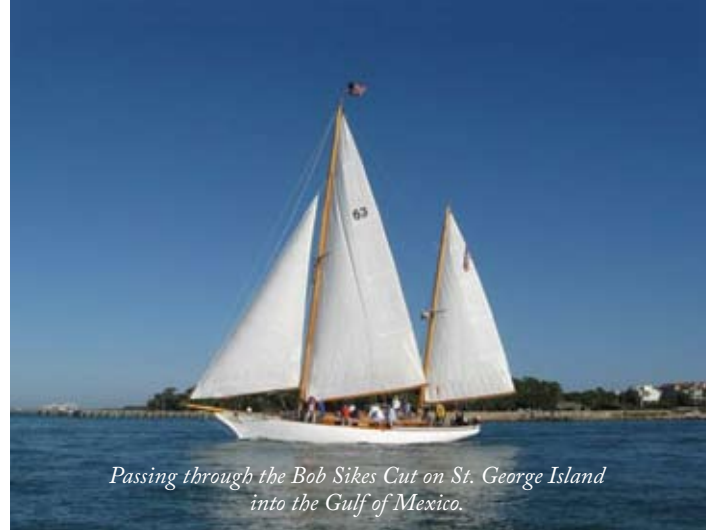
Passing through the Bob Sikes Cut on St. George Island into the Gulf of Mexico.

Sign up for one of four 8-day canoe and kayak trips from Lake Seminole to Apalachicola. Scheduled for the autumn months, these trips are an excellent way to see the Apalachicola River and learn of the flora and fauna unique to the basin. See our web site for more information and to sign up.