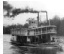
Steamship Callaban Jr.

Heritage's new mission, guided by volunteer captains and crew, is to carry passengers back to the days when sail ruled the seas and Apalachicola was the bread basket of the south. The sound of wind in the rigging and the slap of water on the wooden hull complete the effect of a journey through time. Through exhibits at the museum, see the history of the steamships that connected Apalachicola to the upriver ports of Bainbridge and Columbus, Ga. long before rail roads and highways came on the scene. If the winds are favorable the Heritage will travel upriver to Blount's Fort at Prospect Bluff, where in 1816 a single, red-hot cannon ball landed in the powder magazine, causing an explosion heard 100 miles away in Pensacola and destroying the fort, killing nearly all inhabitants.