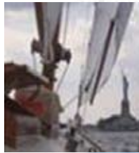
NY harbor passage

The 2007 journey of the sailing vessel Heritage followed the route taken by the ocean going sailing ships of the mid 1800s from New England ports into the port of Apalachicola. Heritage started her voyage in Falmouth, Mass., and sailed south through Nantucket and Martha's Vineyard, on through Newport, R.I. and down Long Island into New York Harbor. From there, Heritage proceeded through Chesapeake Bay and on the outside past the capes of the Carolinas and into